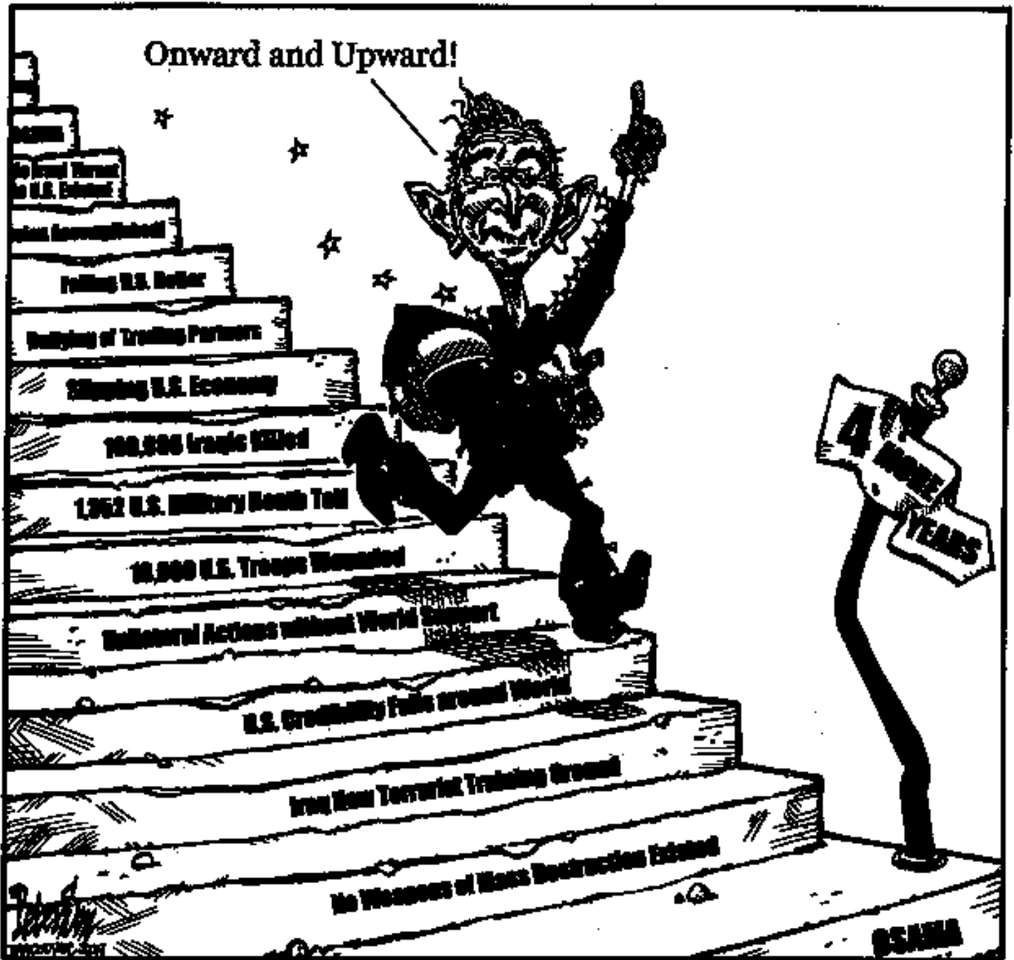
ROY PETERSON Courtesy Vancouver Sun