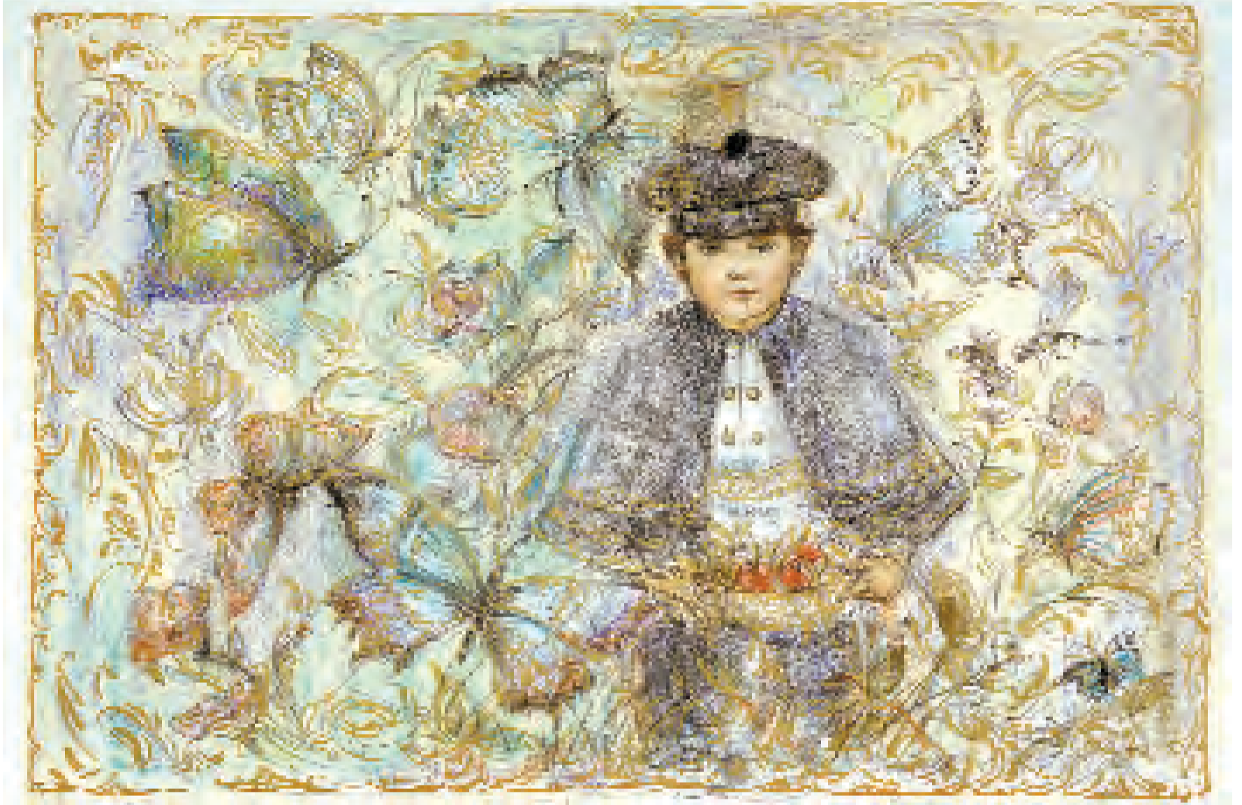
My America Stone Lithograph on Rives Paper 18" x 20"