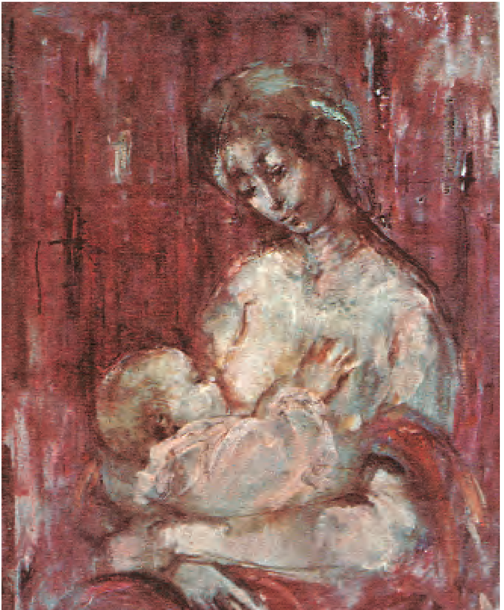
Nursing Mother Oil on Canvas 39" x 30"