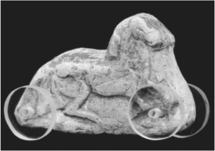
Two horses (modern wheels). Egypt, Naukratis, sixth century B.C.

buried at Thebes with that doll. These were the Egyptians who lived several thousand years ago. They gave civilization many things, including a paperlike material for writing known as papyrus and the 365-day calendar.