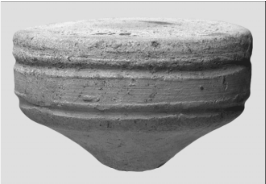
Spinning top. Terracotta. Greece, fourth century B.C.

This was the year 500 B.C. The farm was near Athens, the very cradle of western civilization, law, and medicine. It will be 200 more years before the Greek philosopher Plato founds a school known as the Academy. This is the land where rudimentary forms of government will influence the world to this very day, where Aristotle will enlighten the minds of mankind and be the mentor to Alexander the Great, and where ancient religious festivals will become the foundation of the celebrated Olympics.