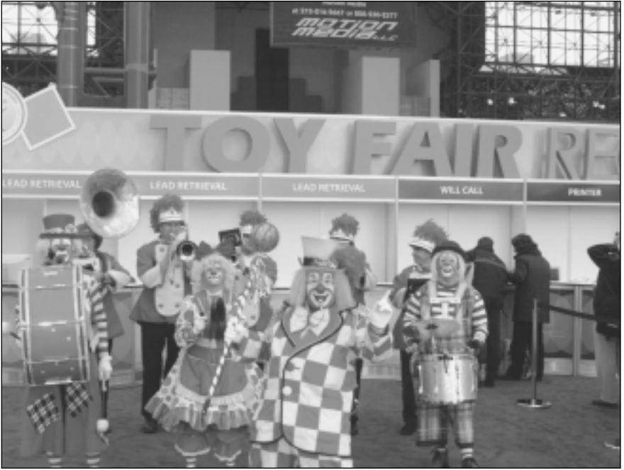
2003 American International TOY FAIR.

others? And what is it, beyond the mere making and selling of a toy, that can bring it to blockbuster status today? Promotion and public relations engines, for example, have recently added mightily to the power of advertising. Entertainment plays a critical role, too, as more and more toys are born not from a toymaker's bench as much as they are born from a screenwriter's pen.